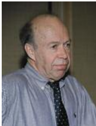
Climatologist James Hansen is shown during his presentation at the AIBS annual meeting in May.

Climatologist James E. Hansen, of the NASA Goddard Institute for Space Studies, warned colleagues in a recent paper against indulging their professional "reticence" despite the risk of disastrous SLR. By Hansen's calculation, "business as usual" greenhouse gas emissions could lift