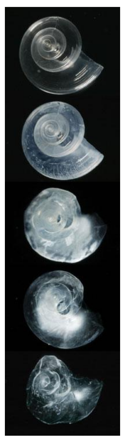
The pteropod, or "sea butterfly," is a tiny sea snail about the size of a small pea. The photos above show what happens to a pteropod's shell when placed in seawater with pH and carbonate levels projected for the year 2100. The shell slowly dissolved over 45 days.