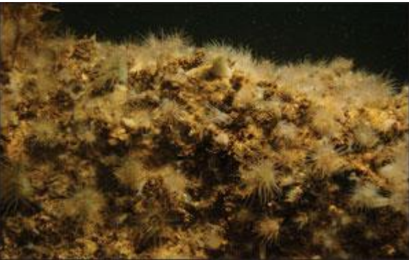
Coral reefs are falling victim to disease, warming waters, and acidifying oceans. The growth of coral reefs, especially in colder waters, is slowing in the open ocean as levels of CO_2 are rising in the global atmosphere. The oceans absorb nearly a third of the airborne CO_2 , creating chemical changes that raise acidity and even threaten warm-water coral reefs, like this one (top) in St. Croix, U.S. Virgin Islands. Oyster reefs in the Chesapeake Bay (bottom) and other coastal waters could also suffer from growing acidification. Laboratory research indicates that higher levels of CO_2 would slow shell growth of young oysters.

If the ocean continues to acidify, seawater could once again become corrosive to calcium carbonate structures, dissolving coral reefs and the shells of many marine organisms. The oceans are already 30 percent more acidic than